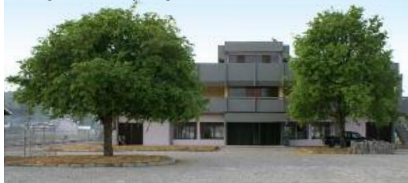
Passenger terminal and parking area

P.O. Box 414 H.J. Nederhorststraat 1 2800 AK Gouda The Netherlands T +31 (0)182 59 06 30 F +31 (0)182 59 08 70 E info@baminternational.nl I www.baminternational.nl