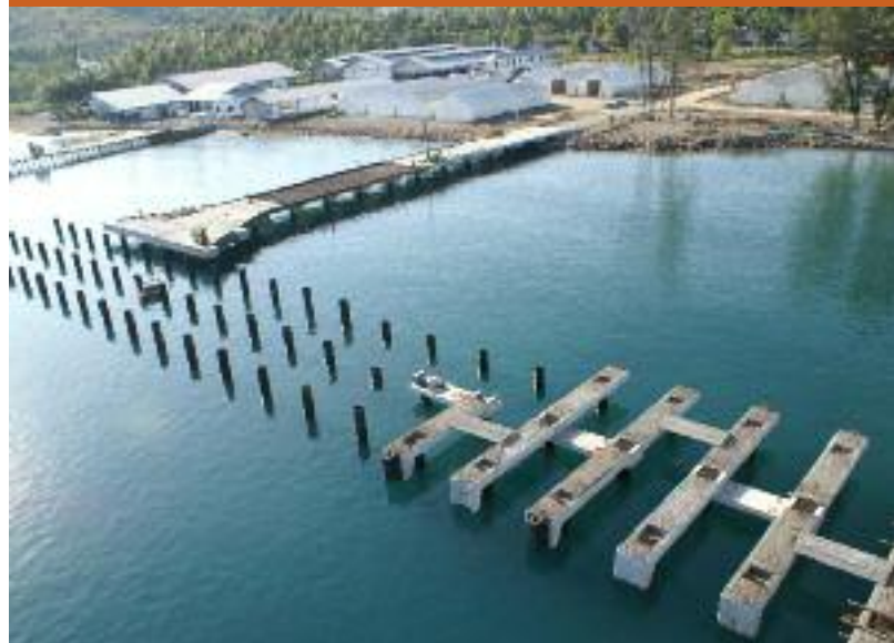
Berthing facility and approach during construction

After an extremely short construction period of just over 100 calendar days, the new berthing facility (140 metres in length with an 80-metre approach trestle) had progressed from the steel pile foundation to the finishing layer. The concrete pile caps and beams as well as the concrete panels were all pre-constructed, while the concrete finishing layer was poured in situ.