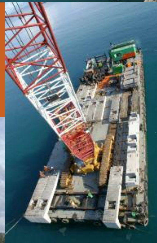
Crane barge for piling works and precast installation