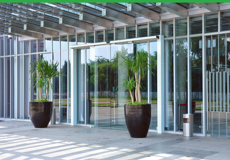
Entrance of the building